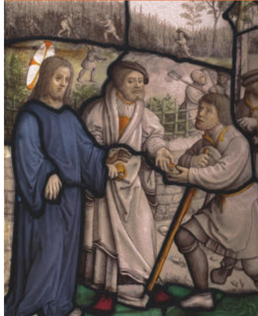
Excerpts from the Labyrinth for Mass ©2001, 1998, 1970 CCD

Saturday Vigil: 4:00 p.m. Sunday: 7:00 a.m. (St. Francis Chapel) 9:00 a.m. and 11:00 a.m.